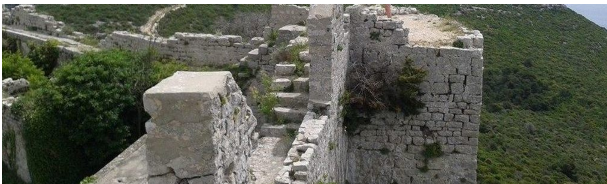
The remarkably well preserved fortress in Ston, Croatia

Day 4 - Private boating from Split - Meet your skipper on the Riva for a full day on the water and island discovery. Start by stopping in the small town of Milna (on Brac Island) for a coffee or tea, then head on your way to discover Hvar & the Pakleni Islands. Stop in quiet bays and coves, swim, snorkel and enjoy the water, then head inland to a local spot for lunch. Spend the afternoon soaking up more of the Adriatic before being dropped off back in Split in the evening.