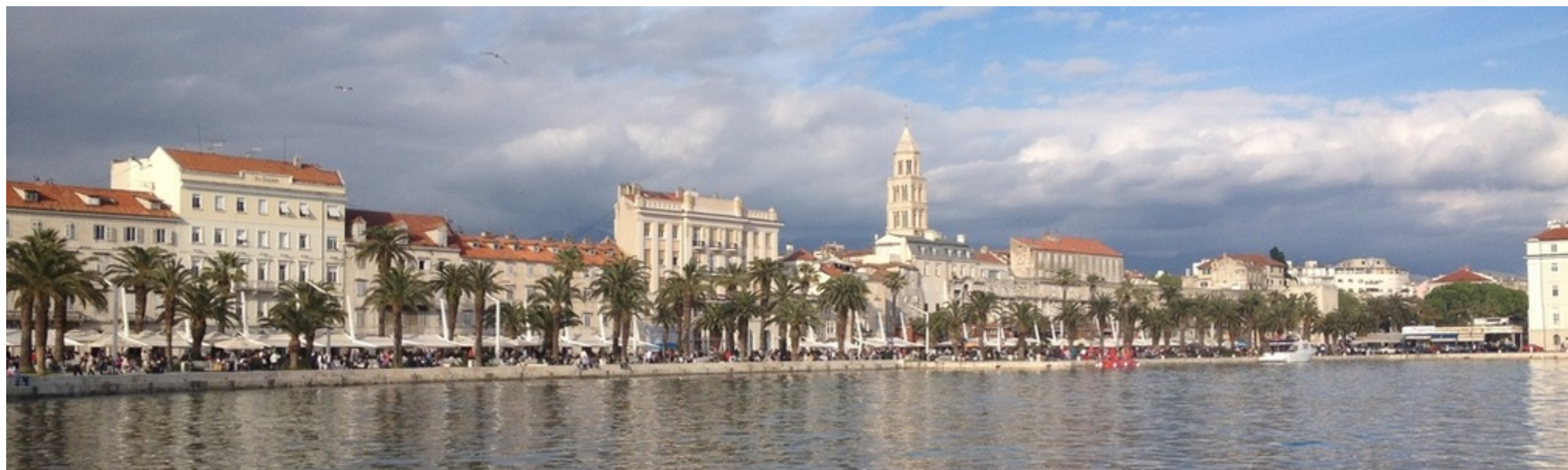
Explore the stunning and historical city of Split and discover Diocletian's Palace!

Day 1 - Arrive in Split and do as the locals do - sip an afternoon coffee on the Riva (the famous promenade that lines the sea). Embark on a privately guided city tour and enjoy roaming through the second largest city in Croatia with architecture from 295 AD. The historic center of Split is built around the remains of the Roman Palace of Diocletian, and is marked as a UNESCO World Heritage Site. Visit Diocletian's palace, see the basements of the cathedral, Jupiter's temple, the crypt, the church of St. Martin and learn about the traditions of the Dalmatian coast.