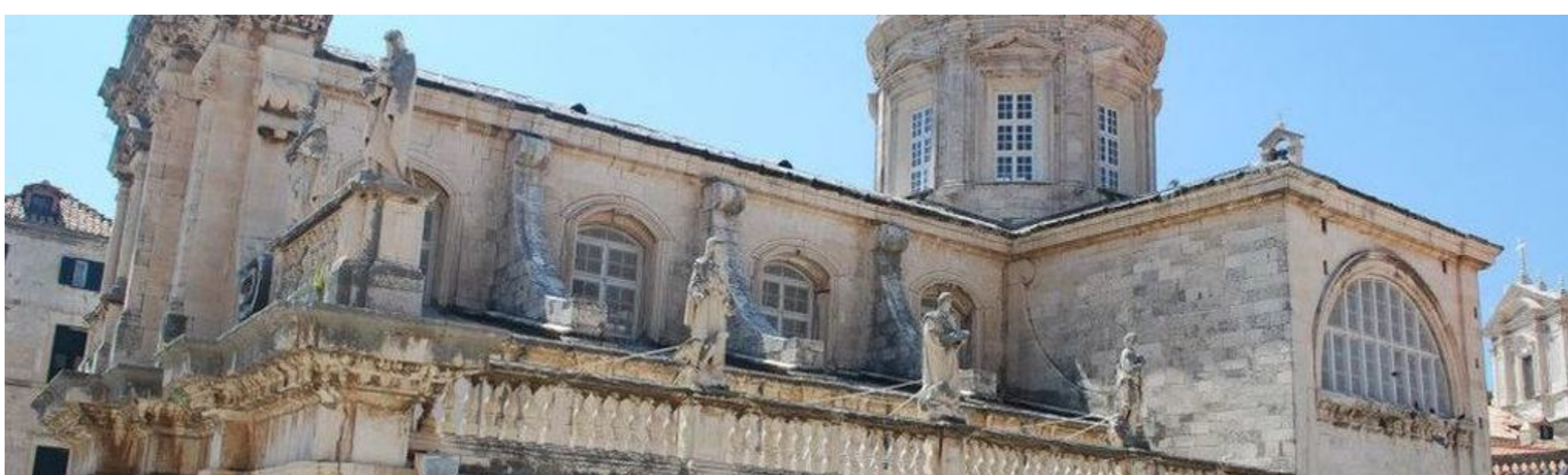
The history and beauty of this city is unmatched!

Day 5 - Enjoy breakfast at your hotel and then you are off to your next destination, on the way to Dubrovnik, which is the city of Ston. Ston is home to what has been nicknamed, The Great Wall of Croatia. Here you will find the longest complete fortress system around any European town. Take some time to explore, then board a small boat to try some oysters fresh from the sea and see how they're harvested on a private excursion to Ston Bay. Continue onto Dubrovnik. In the late afternoon, explore Dubrovnik on a privately guided tour with an expert local guide.